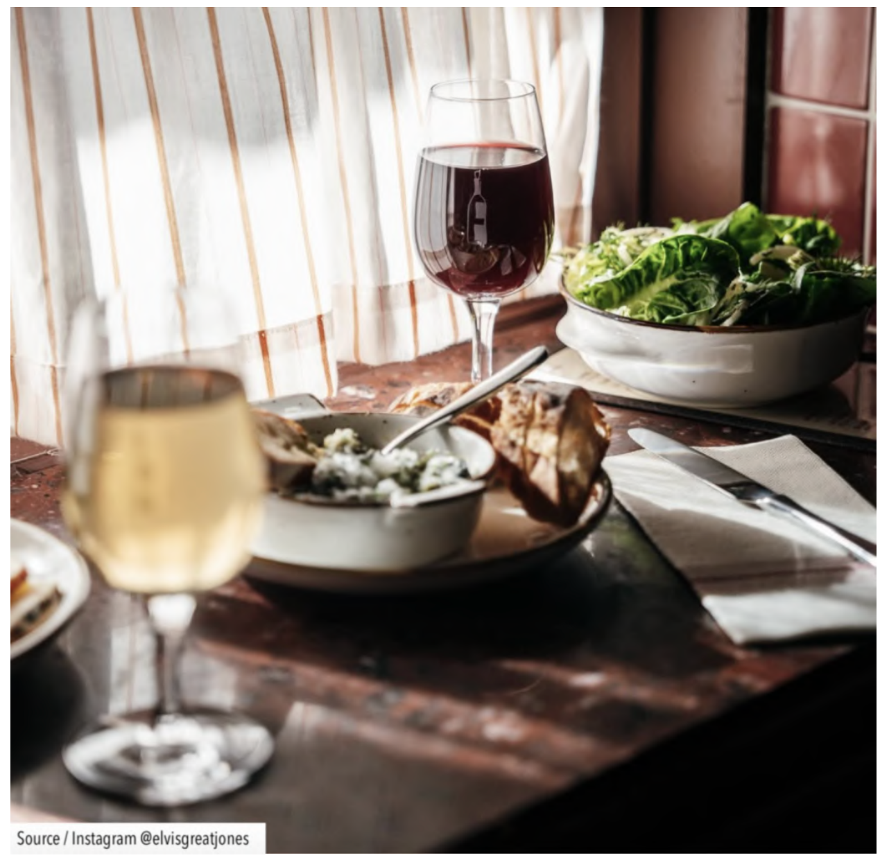
New Cozy Wine Bar in NoHo You'll Love

A charming new wine bar has just opened in NoHo, brought to you by the team behind The Nines. Elvis on Great Jones offers an inviting atmosphere perfect for enjoying a carefully curated wine selection alongside delicious small plates like anchovies, cheese, and escargot. If you're looking for your next go-to spot for a relaxed evening, this is it!