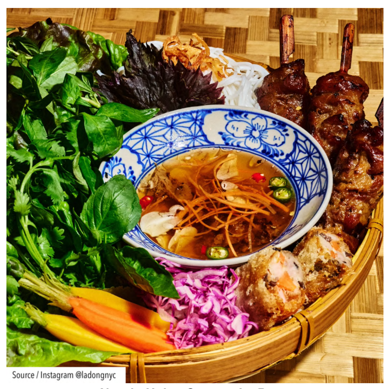
New in Union Square: La Dong

From the team behind Thai Villa and Pranakhon comes La Dong, a brand-new Vietnamese spot in Union Square. With stunning interiors and a warm, welcoming vibe, it's the perfect place to cozy up with a bowl of pho, the rich broth and high-quality meats are a must-try.